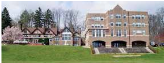
Bryn Mawr Country Day School of the Sacred Heart

Congratulations to Bryn Mawr Country Day School of the Sacred Heart, winner of the Young Alum Contest, which ran on Facebook from Nov. 21-Dec. 31, 2014. AASH will donate $1,200 to Bryn Mawr's scholarship fund to recognize the school for registering the most young alums on the AASH website!