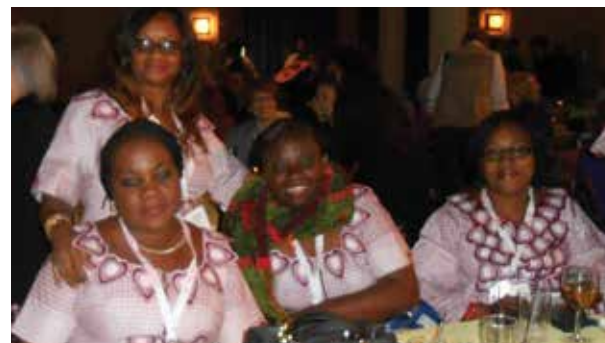
The Congo delegation