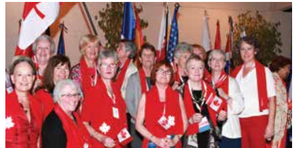
The Canadian delegation