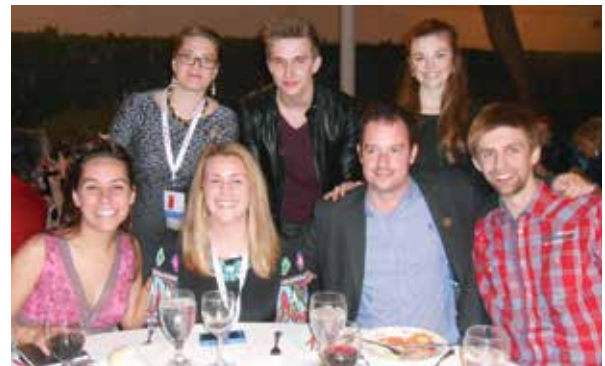
Young alums enjoy evening festivities